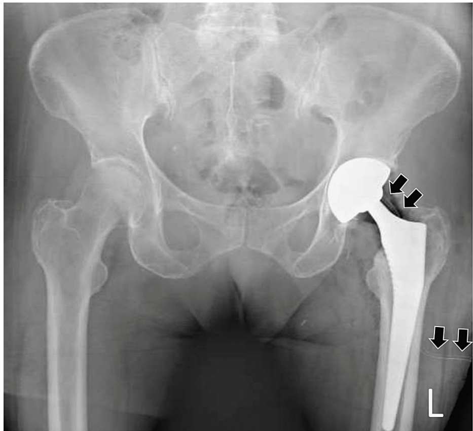
FIGURE 2: Immediate postoperative radiograph following total hip arthroplasty.

Standard anteroposterior hip and pelvis radiograph taken immediately postoperatively. Notice the position of the vacuum drainage tube (as depicted by black arrows) and its course toward the posterior-inferior aspect of the dual-mobility cup.